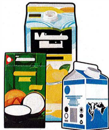
Food and Beverage Cartons (empty)