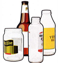
Bottles and Jars (empty)