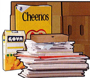
Newspapers, Mail, Cereal Boxes, Magazines and Flattened Cardboard