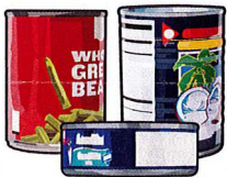
Aluminum and Steel Cans (empty)