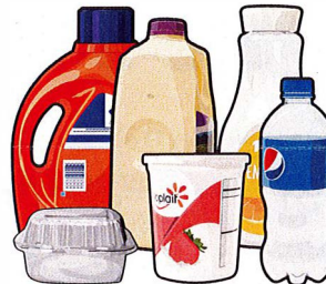
Kitchen, Laundry, Bath: Bottles and Containers (empty, caps on)