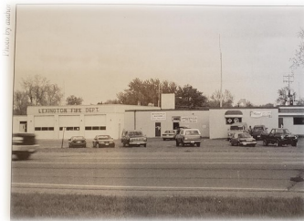
Lexington Fire Department