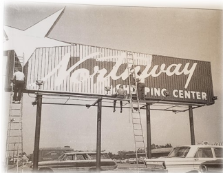
Northway Shopping Center

We are thankful to all the residents and businesses that call Lexington home, and look forward to many more years for our GREAT CITY!